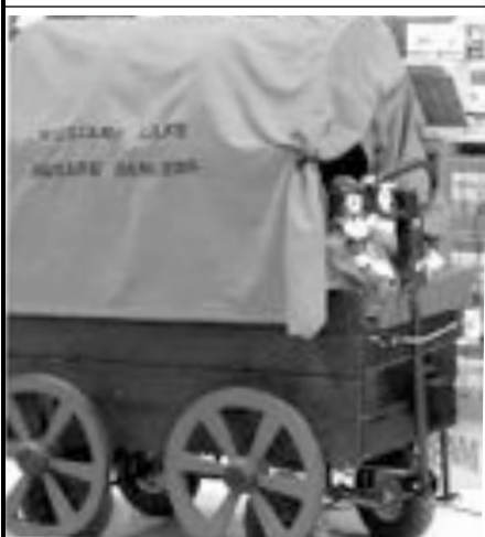
Williams Lake's Travelling Audio System